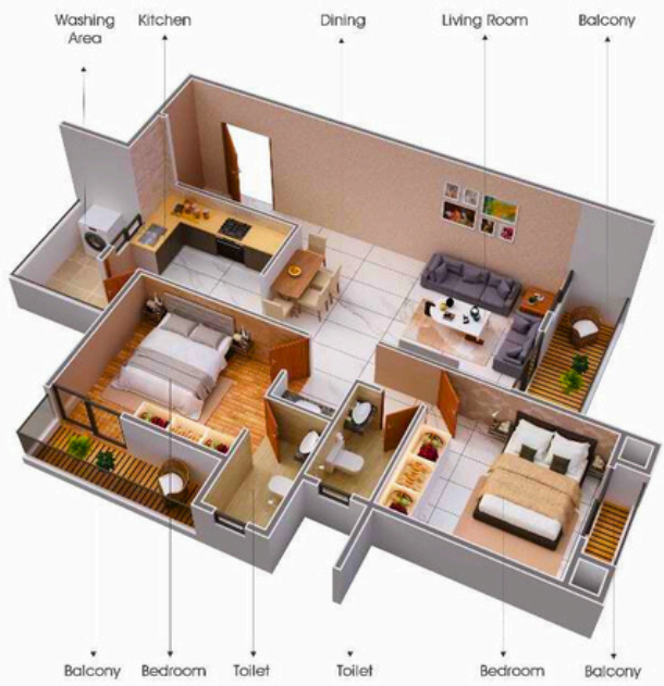
2 BHK ISOMETRIC