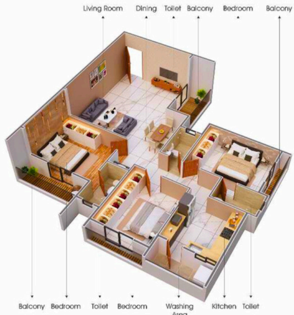
3 BHK ISOMETRIC